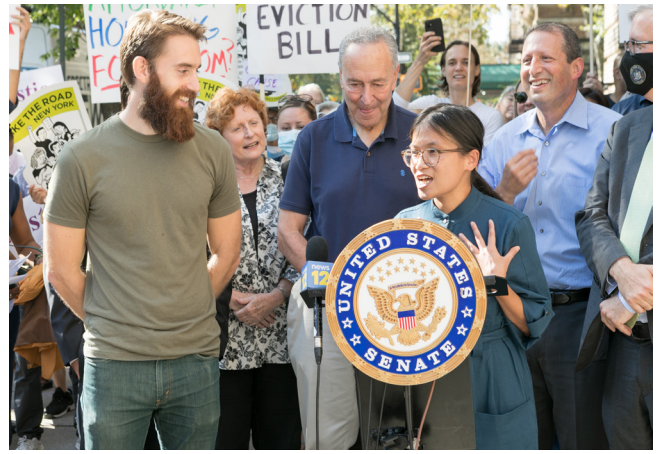
Tenant leaders from the Greenbrook Tenant Coalition at a rally denouncing Greenbrook's practices