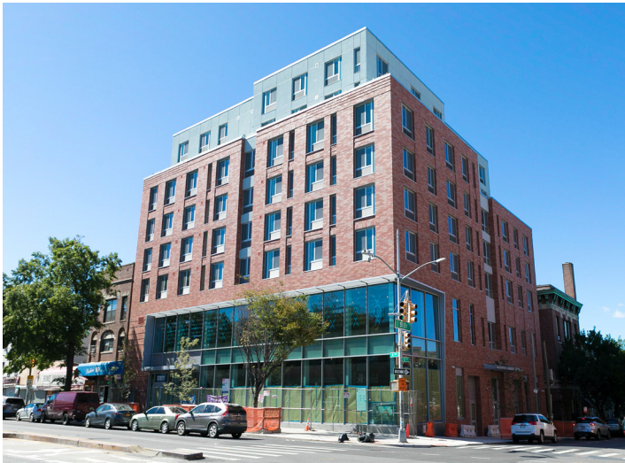
Tenants began moving into Sunset Apartments and Brooklyn Public Library is building out the library space.