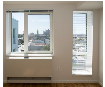
A three bedroom unit located on the 8th floor of the Sunset Park Apartments building