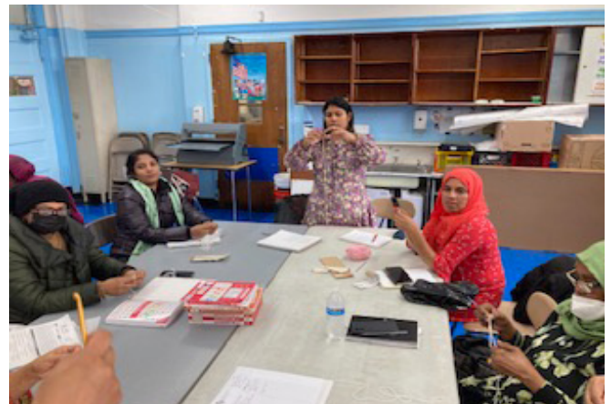
FAC's Adult Education Kensington students participate in the integrated English language sewing class