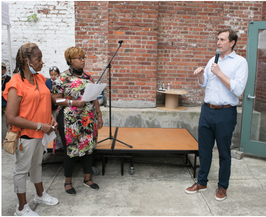
Daniel Goldman, recently elected Congressman for District 10 answers questions from local public housing leaders at the FAC Summer BBQ