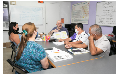
FAC Adult Education students in CDL class