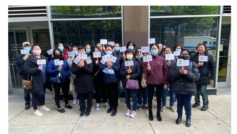
Tenants rallying for their rights.