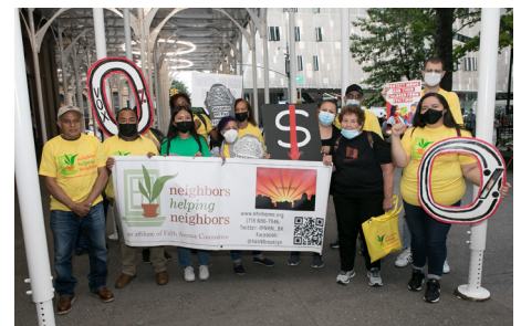
Tenants organizing for lower rents at the Rent Board Guidelines hearing