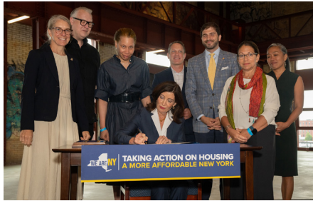
At Governor Hochul's Press Conference in July

Ensuring 2,000 Affordable Units Get Built in Gowanus