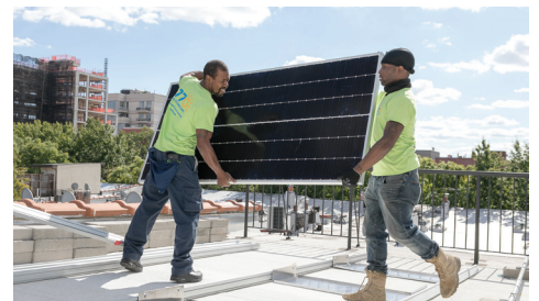
Solar panel installation