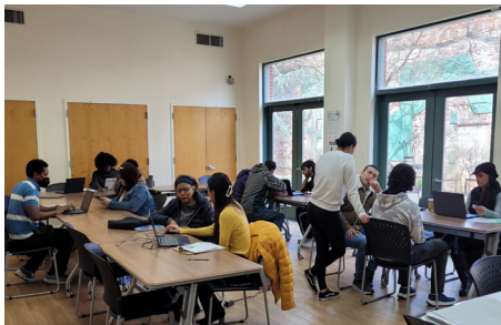
2023 Tax preparation session